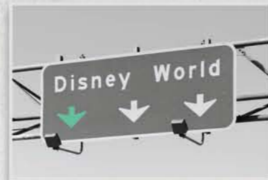
Certificate in Airline, Travel, Tourism & International Flight Attending